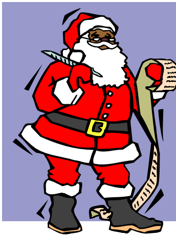
New Germany Minnesota